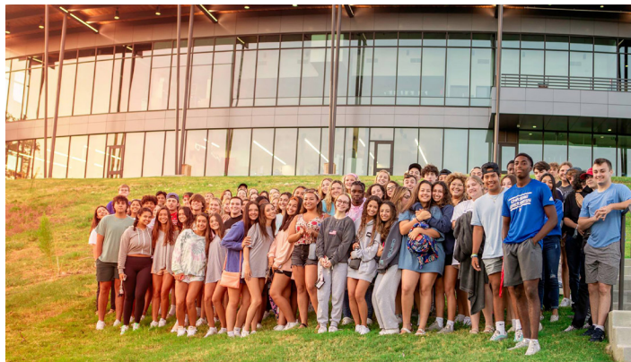
GIVE TO CLASS OF 2022

Get Ready Vikings, to get up and give! Next Thursday, September 23 is North Texas Giving Day and we have challenged our students to raise $25,000 as a class. The class that achieves their goal will be rewarded with a movie night or live-entertainment on center field with pizza and ice cream.