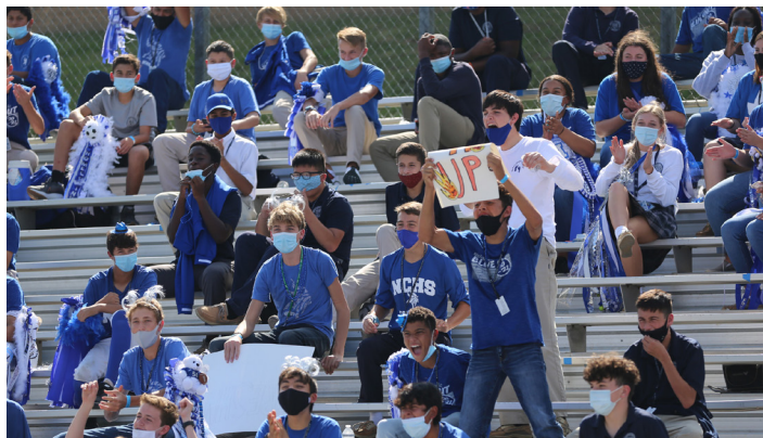
GIVE TO CLASS OF 2024