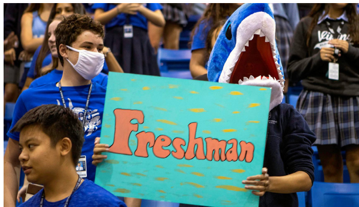
GIVE TO CLASS OF 2025