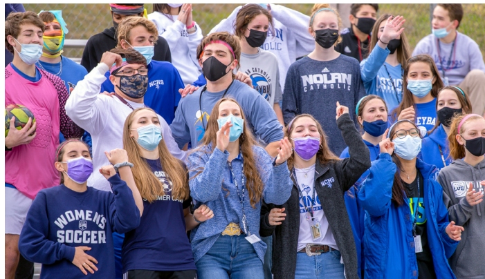
GIVE TO CLASS OF 2023